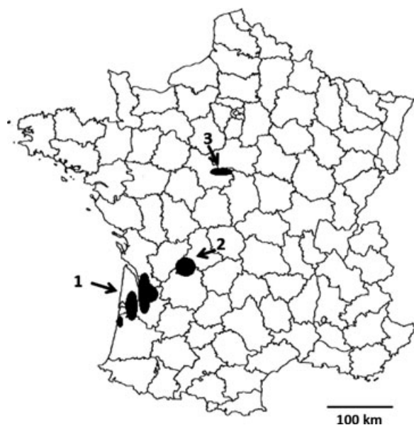
Fig. 1. Distribution of introduced bullfrog populations in France. 1: Colonized area in Gironde (introduction in 1968), 2: colonized region in Dordogne (introduction in 1990). This study was performed in this region (see Fig. 2). 3: colonized region in Loir et Cher (introduction suspected in the 2000). The comparisons of costs between traditional and environmental DNA (eDNA) surveys were performed in this area (see Discussion). (Map kindly provided by J. Lescure and J.-C. de Massary).

Native to Eastern North America, the American bullfrog has been introduced worldwide (Lever 2003). It is considered to be one of the world's 100 worst invasive species (Lowe et al. 2000; D'Amore 2012). In Europe, bullfrogs have been introduced in at least 25 countries during the 20th century (Ficetola et al. 2007a). Three populations are successfully established in France (Fig. 1), and two of them are subject to control actions consisting of egg mass removal, tadpole trapping and shooting of juveniles and adults (Dejean 2008). In the population established in south-western France (Dordogne), bullfrogs were detected in 35 water bodies in 2006 using traditional survey techniques (calling and visual encounter surveys, Dodd 2010). Control actions started in 2006 and bullfrogs were detected in 19 aquatic sites in 2007 and seven sites in 2008 (Guibert, Dejean & Hippolyte 2010). Control actions seem to reduce the density of bullfrogs, but the relationship between amphibian detection probability and density suggests that small populations are more likely to escape detection (Tanadini & Schmidt 2011). The detection probability of low-density populations can be increased by increasing sampling effort (i.e. increasing the number of visit per site). In this study, we propose to use the newly developed environmental DNA (eDNA) barcoding approach (Hebert et al. 2003; Ficetola et al. 2008; Valentini,